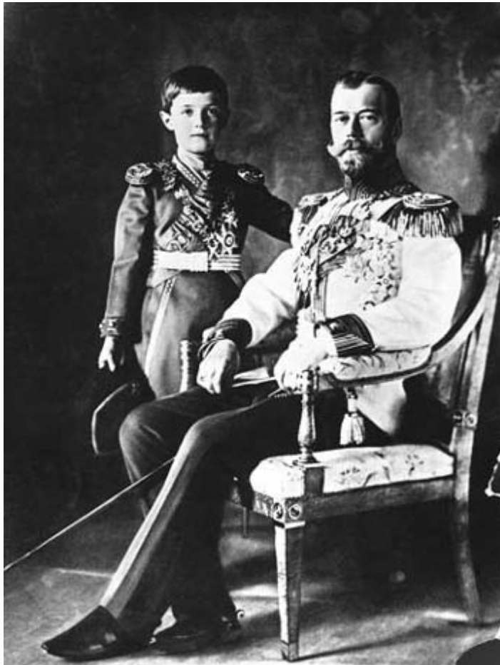
Alexis, heir to the Russian throne, and his father, Tsar Nicholas Romanov II.