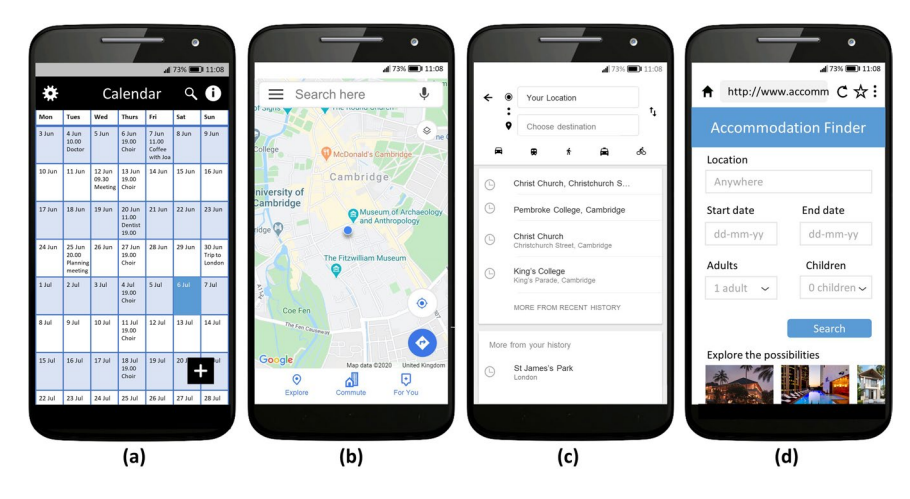
Fig. 1 Interfaces used in the digital interface competence tests. Mock-ups of: (a) a calendar application, (b) a mapping application based on Google Maps, (c) a location choice screen within a mapping application, (d) a website for finding accommodation.

of a smartphone interface on a paper showcard and asked what they would do to achieve a particular goal. The showcards were created in English, based on those in the previous UK survey<sup>12</sup>, and then adapted for use in the different countries with different languages and locations. The English versions of the showcards are shown in Fig. 1.