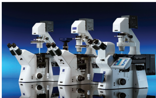
Figure 3 | Different configurations of the Axio Observer instrument from Carl Zeiss. Axio Observer A1 with a manual stand (left), Axio Observer D1 with a semimotorized stand (middle), and Axio Observer Z1 with a fully motorized stand and including all optional features (right).

At all levels, maximum performance is expected from a microscope system, and this is the basis of the Axio Observer system. At the core of the overall system are many new functions, including major improvement of contrast techniques to include a new level of differential interference contrast quality with a clearly homogenous background, an apochromatic fluorescence beam-path with homogenous excitation