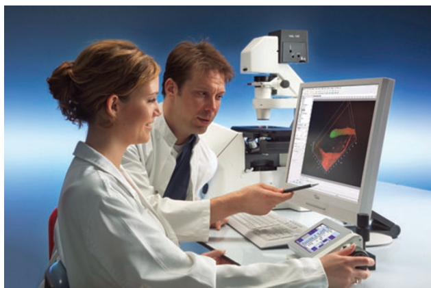
Figure 2 | Targeted analysis with the AxioVision software suite.

no need for any enlargement of the infinity space, which prevents the reduction in optical quality.