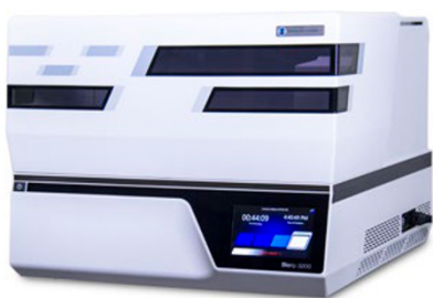
Figure 1 | The BioXp 3200 system, a genomic workstation.

As the scale of genetic analysis has trended away from single-gene studies and toward gene-family, genomic and metagenomic studies, the demand for large-scale DNA-synthesis services and technologies has grown. Moreover, with newer cloning and sequencing technologies, the pace of molecular biology research is accelerating. Synthetic Genomics, Inc., has developed the BioXp system (Fig. 1), available through SGI-DNA, as an in-house laboratory tool to address the increased interest and demand for rapid DNA synthesis. With an assembly module, the BioXp system generates high-quality, linear DNA fragments from custom-designed oligonucleotide pools and reagents across a meaningful section of the complexity continuum in an overnight run. Now, with the introduction of the assembly-and-cloning module, the BioXp system has the additional capability to deliver cloned DNA from a custom DNA sequence in an overnight run (Fig. 2).