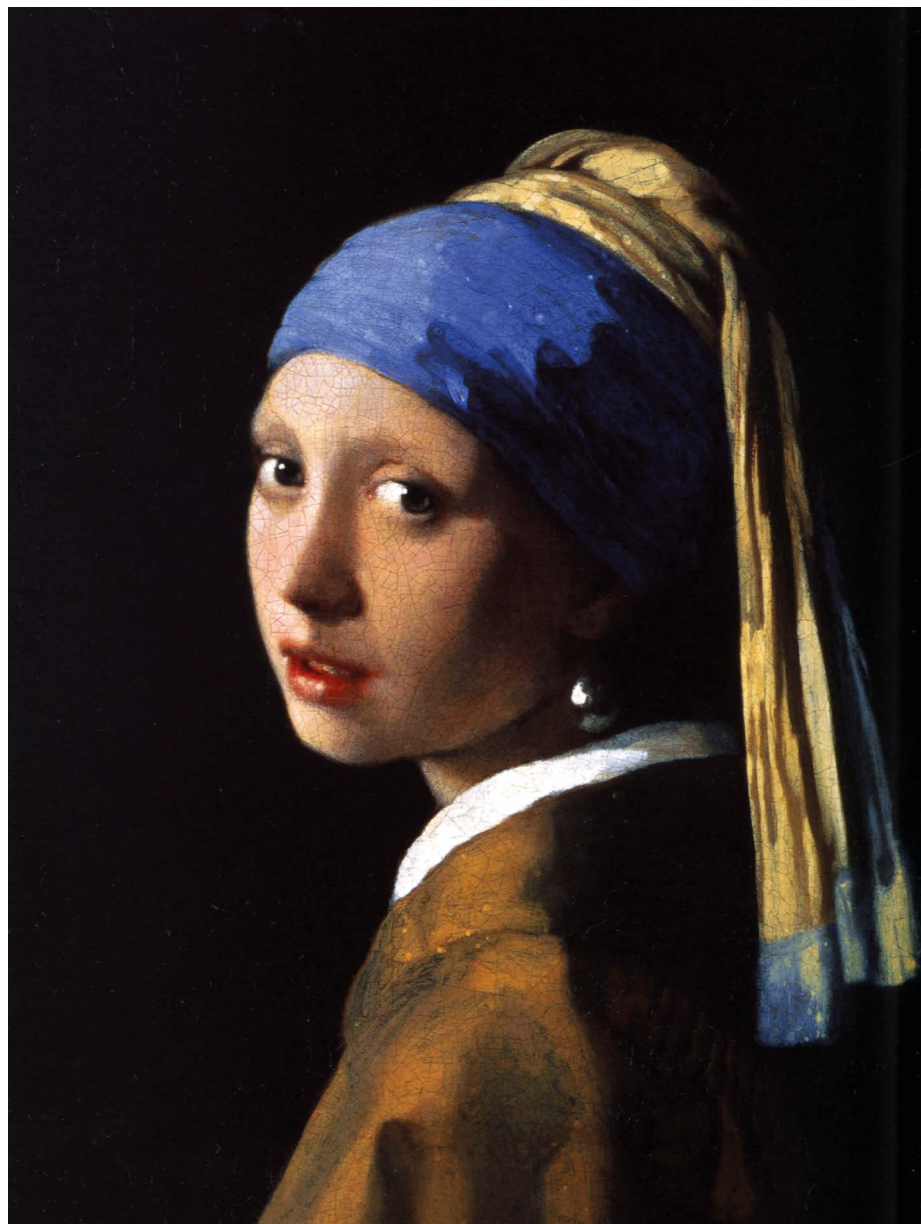
Algorithms have inferred the direction of lighting in Johannes Vermeer's painting Girl with a Pearl Earring (1665) from the bright edge of the girl's face.

(quantification of differences in 3D shapes at various sizes and pose angles), optical-ray tracing and other computational techniques have systematically overturned Hockney's theory much more conclusively than have arguments put forth by other scholars using conventional art-historical methods.