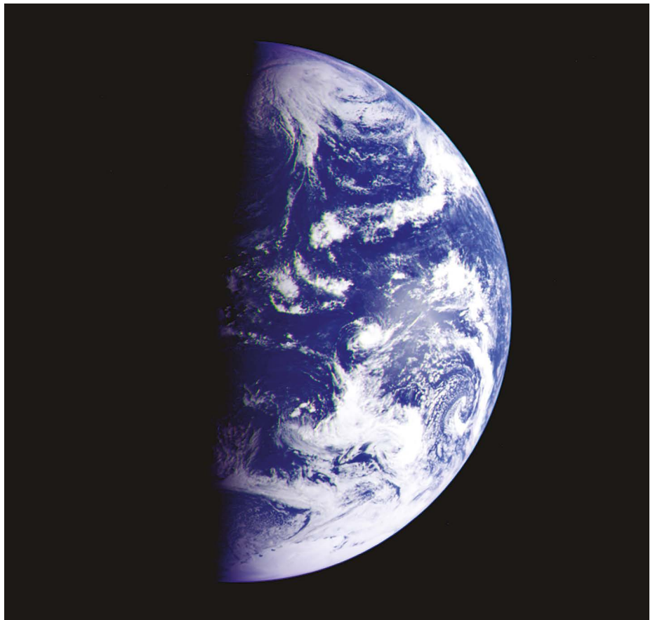
Anything down there? Earth as seen by the Galileo probe in 1990.

It came at a time, too, when the search for life elsewhere in the Solar System was at a low ebb. US and Soviet robotic missions in the 1960s and 1970s had revealed that Venus – once thought to be a haven for exotic organisms – was hellishly hot beneath its dense clouds of carbon dioxide. Mars, crisscrossed by the