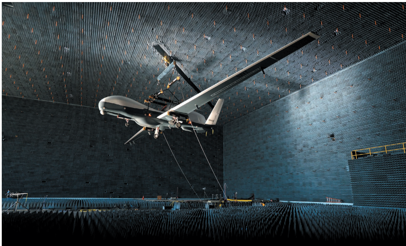
Marine surveillance drones are likely to be among the technologies funded by a new EU research fund.