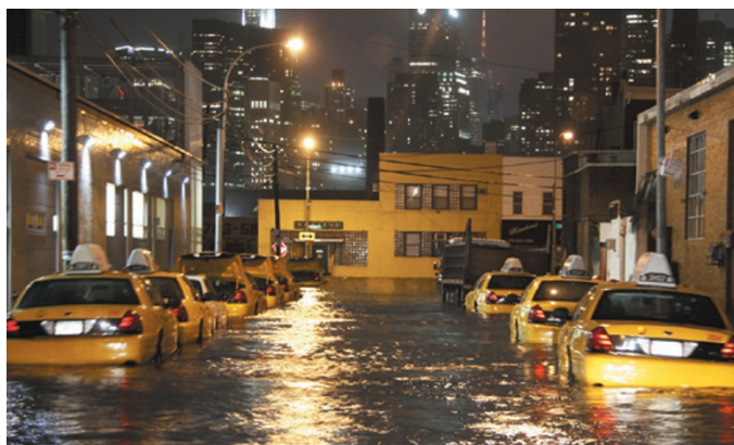
Superstorm Sandy ravaged New York in October.

upgrades are needed. The US Nuclear Regulatory Commission, meanwhile, granted a licence for a plant that uses lasers to enrich uranium for nuclear fuel, a technology that some fear could enable bomb-makers to covertly enrich uranium. Countries also continued to explore unconventional sources of gas and oil to keep the lights burning and cars on the road. The United States proposed rules for the booming shale-gas fracking industry, which has enabled the US electric-power industry to shift 10% of its generating capacity from coal to gas. According to the International Energy Agency, the United States is also on course to be the world's largest oil producer by 2020, and almost self-sufficient in energy by 2035. But there were reminders of the dangers of searching for new oil reserves. Shell was unable to begin its drilling programme in the Arctic sea after damage to drilling vessels, and BP was hit by US$4 billion in criminal fines relating to the April 2010 Deepwater Horizon